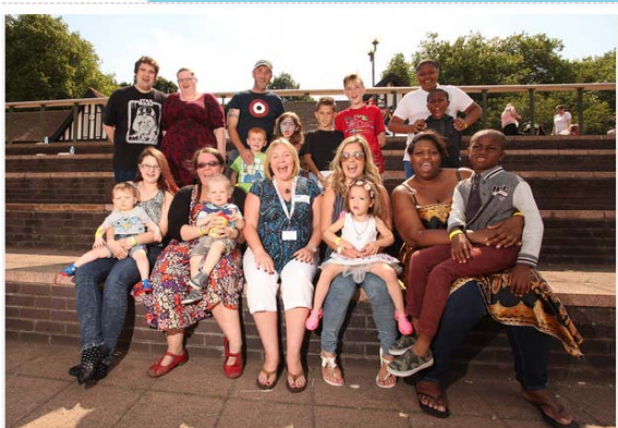
Parents will benefit from mentoring by fellow mums and dads in Nottingham.